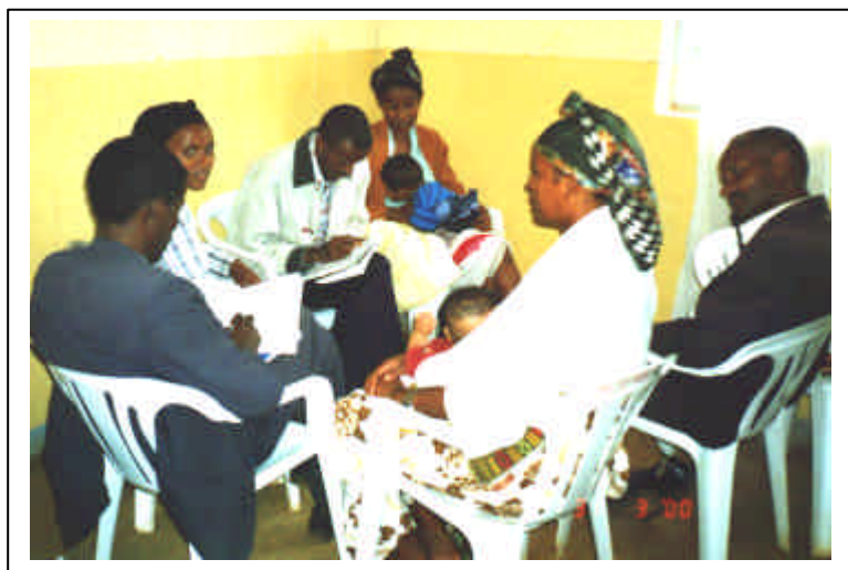
Group Discussion during IBS Marriage Course in Mettu, March 2000