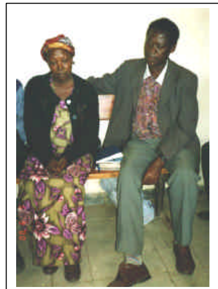
5. A Couple during session at the Marriage Course in Arba Minch, SWS, in Sept. 2000.