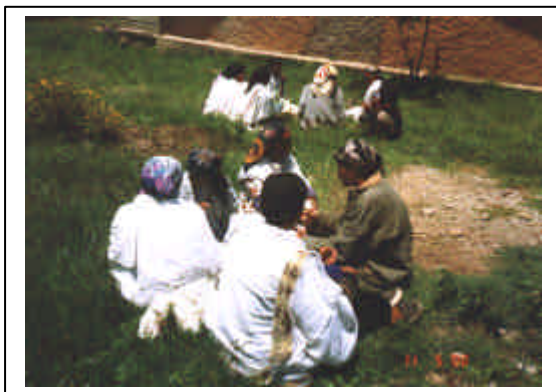
3. Women's Group Discussion during the SCS Marriage Course in Hossana, May 2000