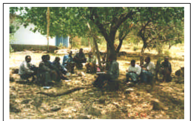
6. Men's Group Discussion during the SWS Marriage Course in Arba Minch, Sept. 2000