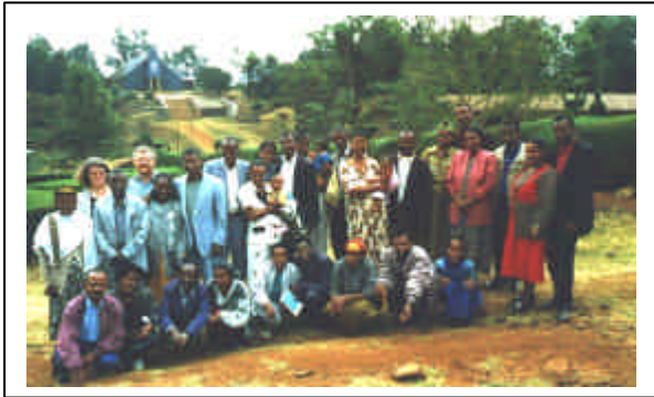
1. The Marriage Course for Pastors and their wives in Mettu, IBS, in March, 2000.