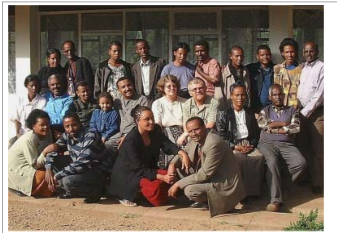
The third FLEP Training of Trainers (TOT) course in Nekemte, April 8-18, 2003