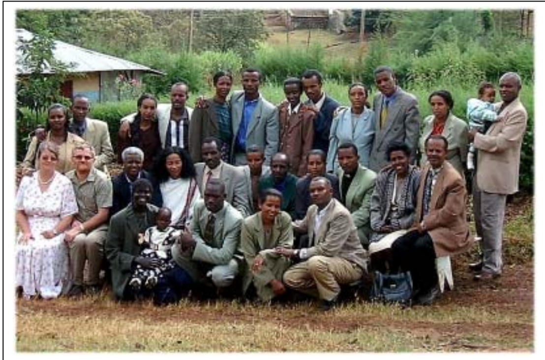
The second FLEP Training of Trainers (TOT) course in Mettu, February 18-28, 2003