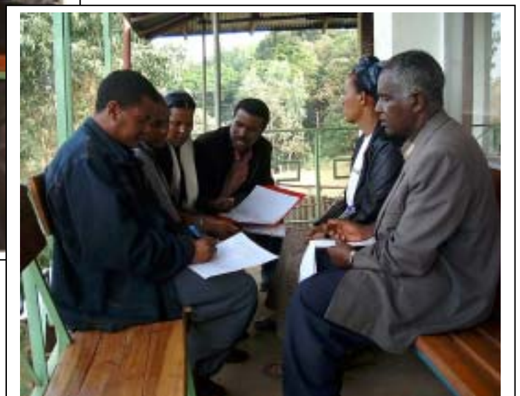
(Below:) Group discussion of participants coming from Central Synod, planning their future service on the field of Family Ministry. (FLEP-TOT in Nekemte, April 2003)