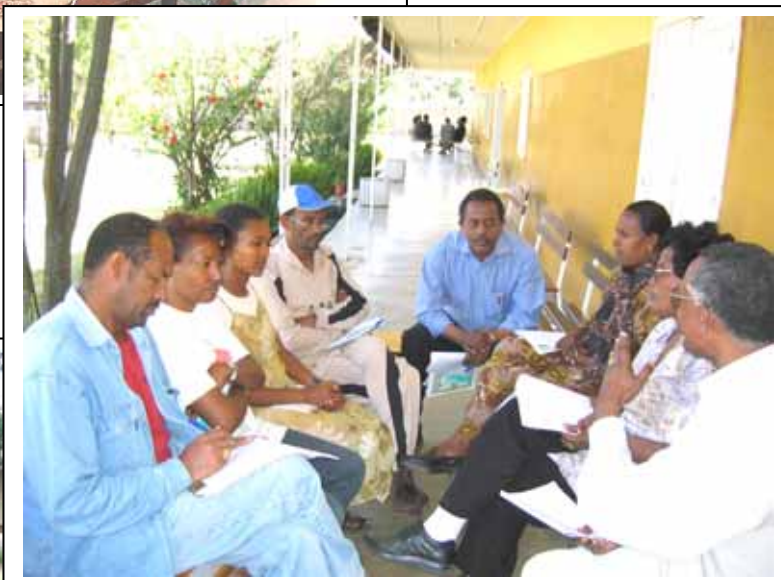
(Right) The first round of the Basic Marriage Course for the EECMY Central Office Staff was arranged in October, 2004. Here is the couples' Group Discussion.