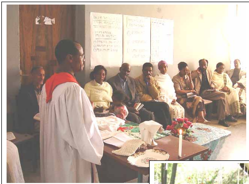
(Beside) The Basic Marriage Courses always are concluded by celebrating the Holy Communion; here in NAW Mekele, January 2004