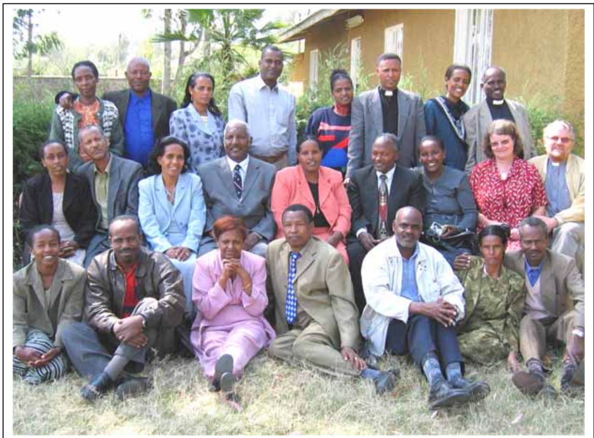
The 5 th FLEP Training of Trainers (TOT) course in Debre Zeit November 1-13, 2004

By end of 2004 some 120 people have taken the Training of Trainers Course for Family Ministry.