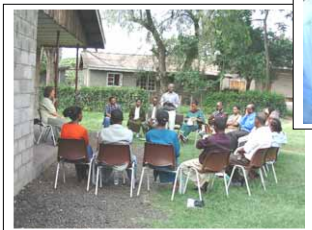
(Above) The 2 nd TOT Refresher Course was arranged in Awasa in May, 2004. It is hot there - outside was sometimes cooler!