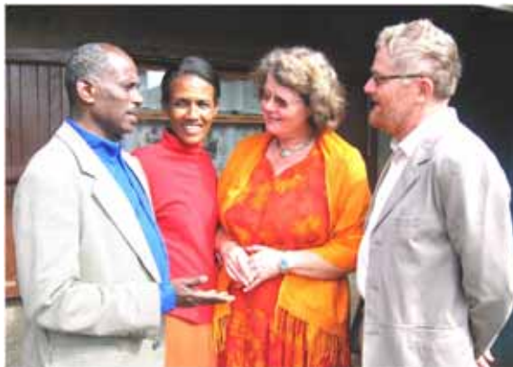
EECMY Central Office Family Ministry team 2004