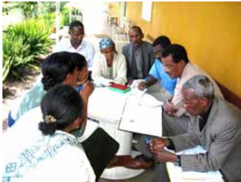
Group work during Training of Trainers' course

The target areas of the Family Life Education Program are all the 20 Church Units (17 Synods and 3 Work Areas), 4 theological seminaries and all the Bible schools. Also the government-run schools could be a target group in the future. There could be many other additional target groups. When talking about expanding the work the crucial point is the training of local instructors.