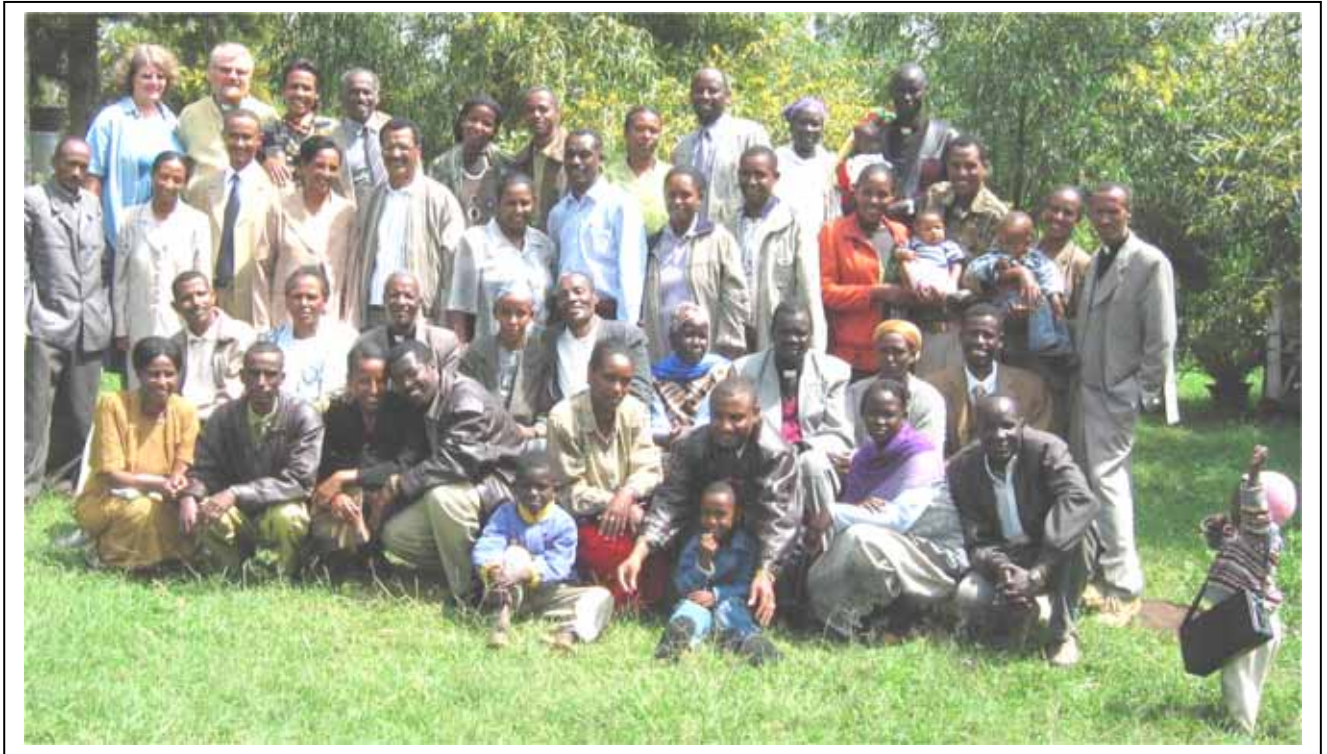
The 4 th FLEP Training of Trainers (TOT) course in Debre Zeit August 30 - September 10, 2004