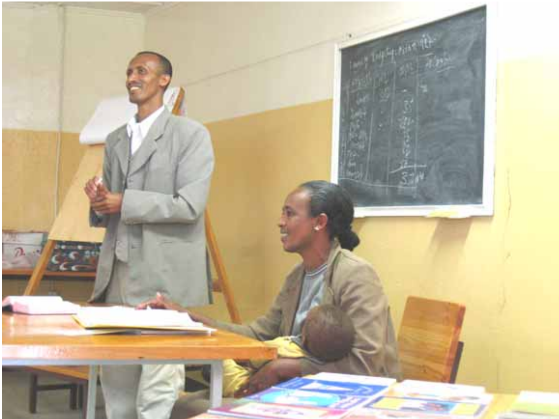
Teaching practice during the 4 th Training of Trainers Course, September 2004

THE FIVE YEARS OF THE Christian Family Life Education Program 2000-2004