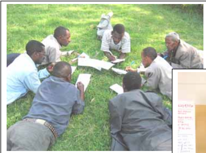
(Above:) Men’s group work during 4 th Training of Trainers in Debre Zeit, September 2004