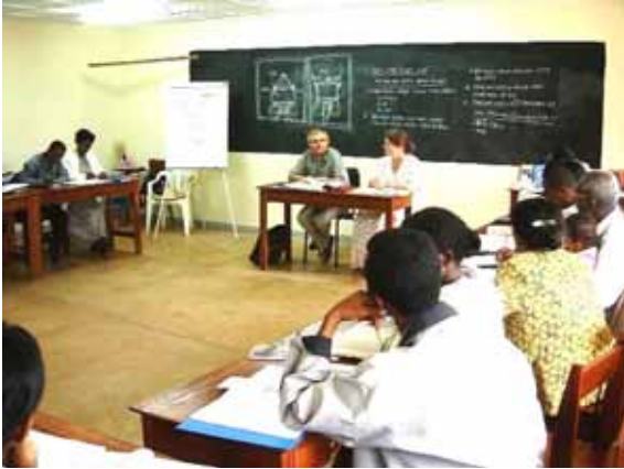
Session at a Training of Trainers' course

Christian Family Ministry is bringing hope to Africa which is suffering an AIDS pandemic. Educational work always takes time, but it is worth doing. The Churches could well share their experiences and put in practice each other's findings and working methods.