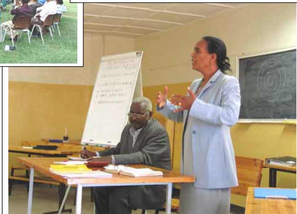
(Beside) Teaching practices are an essential part of Training of Trainers Courses. Even the most experienced participants have been willing to practise for Family Ministry. 5 th TOT in Debre Zeit, November 2004